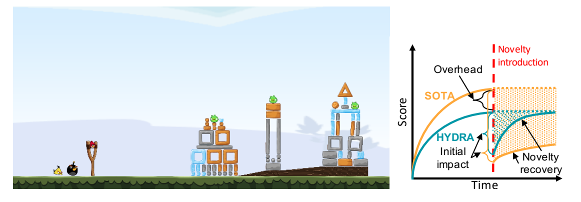
Figure 1: A sample Science Birds problem (left) and relevant metrics (right). While we expect that a SOTA agent will outperform novelty responsive AI systems (e.g., HYDRA) as it is would be tailored to the particular domain, we expect HYDRA to recover more quickly after novelty is introduced.

learning will enable our agent to mitigate the effects of the novelty on its performance and, when possible, take advantage of new opportunities available due to the change in the environment on future problems in the sequence. Figure 1 illustrates this process and how we intend to measure performance against a state-of-the-art AI system that is not designed to respond to novelty.